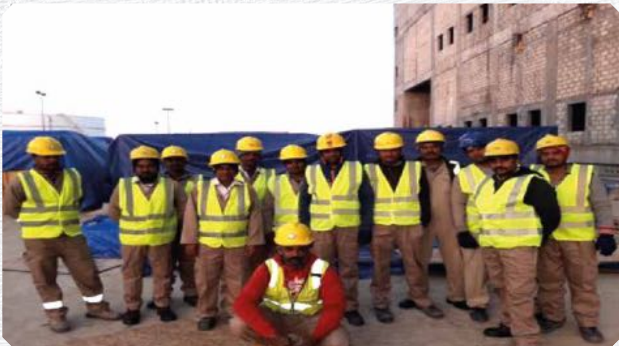
Our Civil Team